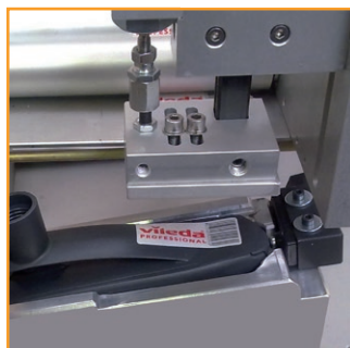
Positioner for irregular products