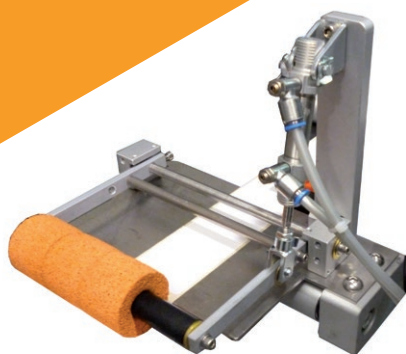
Pneumatic roller applicator

Mechanical unwinder Stop photocell Positioning device with motorized rolls Top table base support Micrometric adjustment unit Applicator roll with start sensor